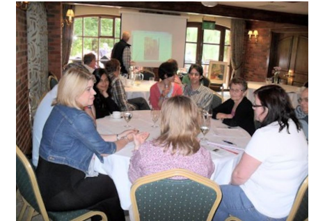
Chat Day at Branston

We are always keen to promote any projects or news on FAP whilst retaining the Informal Style of the day.