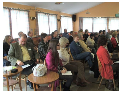
Family/Information Day at Swarkestone